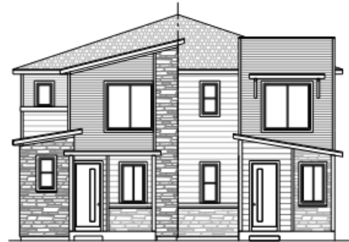
Elevation D (R769.1 - Boston) (R770.1 - Chicago)