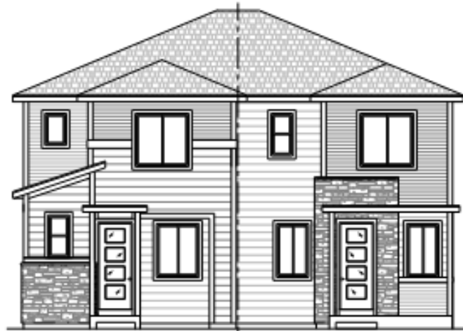
Elevation A (R769.1 - Boston) (R770.1 - Chicago)