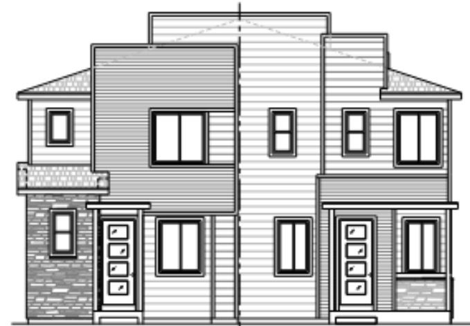
Elevation C (R769.1 - Boston) (R770.1 - Chicago)