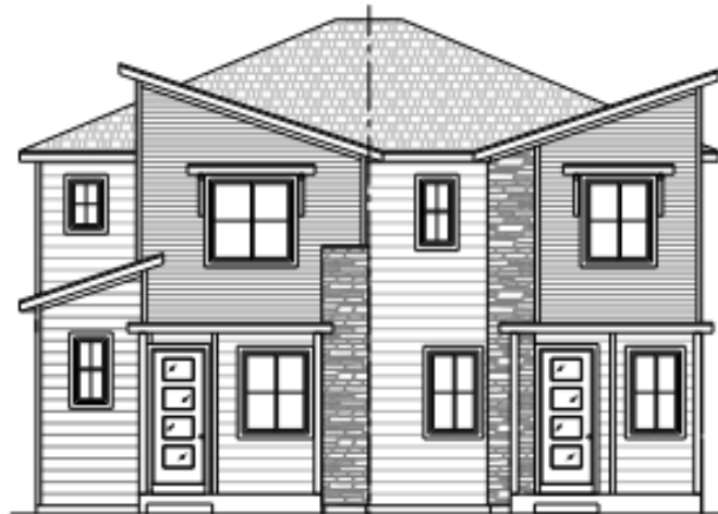
Elevation B (R769.1 - Boston) (R770.1 - Chicago)