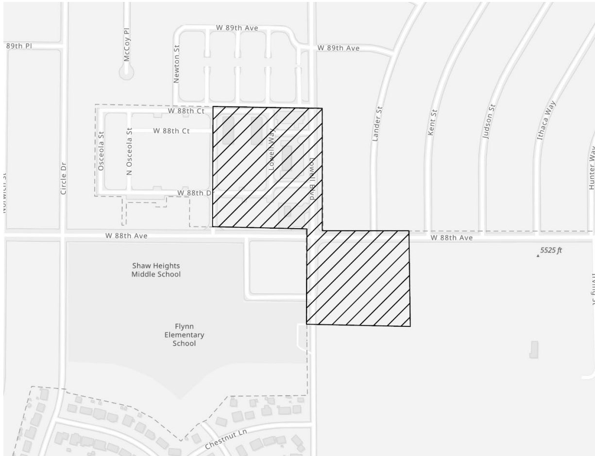
Groundwater Use Restriction IGA: 88th and Lowell